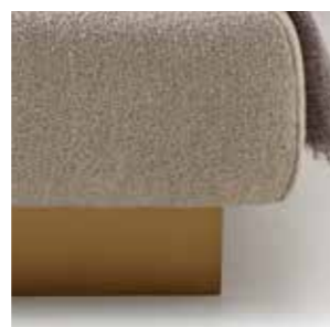
BASEMENT wooden frame lacquered frontmetal sheet