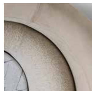
COMBINATION leather / fabric / leather

There is no contemporaneity without a deep knowledge of the past. This is the promise as well as the inspiring element at the base of the Prospettiva Collection.